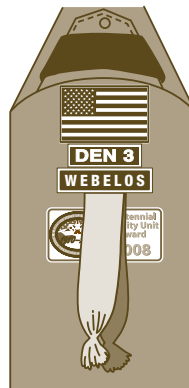
WITH DEN EMBLEM