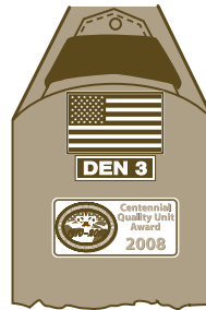
WITH DEN NUMERAL