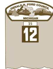
OPTIONS FOR LEFT SLEEVE